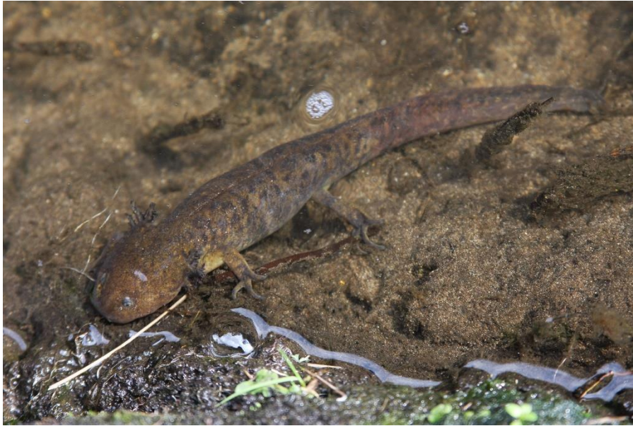
FIGURE 1. Toluca Axolotl ( Ambystoma rivulare ) from the study site in Mexico.

immunoglobulin and modulation of the immune defense. Eosinophils act in inflammatory processes and are associated with defense against metazoan parasites. Monocytes are associated with defense against infections and bacteria. Finally, the exact role of basophils is not yet clarified, but they are known to be implicated in the inflammation process (Jain 1993; Thrall et al. 2006).