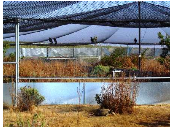
FIGURE 2. Common Ravens ( Corvus corax ) perching on head-start enclosure for Desert Tortoises ( Gopherus agassizii ) with an egg-donor female tortoise in foreground.

Yearling release experiments. —4DN:Seven of eight yearlings released just outside their head-start enclosures in September 2004 were dead by the following summer: three from predation and four from environmental conditions (winter kill