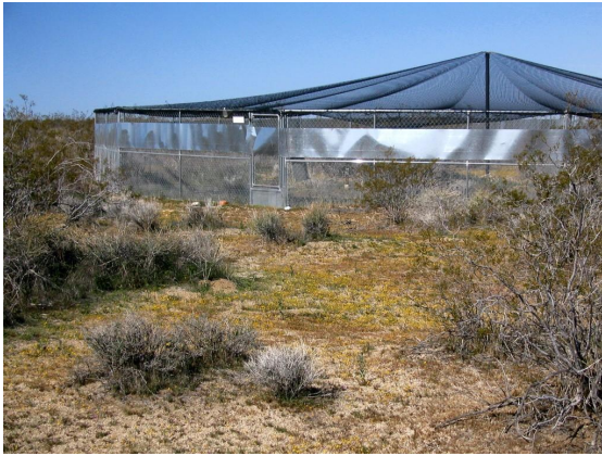
FIGURE 1. Photograph of one of three enclosures at the head-start facility for Desert Tortoises ( Gopherus agassizii ) at Edwards Air Force Base, California, USA.

Egg procurement. —We fitted wild adult female tortoises living near the head-start facility with radio transmitters (model AI-2, Holohil Systems Ltd., Carp, Ontario, Canada) and we radio-located them periodically using Lotek receivers (Newmarket, Ontario, Canada). Females used as egg donors were clinically healthy upon field examination and were confirmed to be sero-negative for Mycoplasma agassizii antibodies by ELISA tests done on blood samples by Dr. Mary Brown at the University of Florida. When field x-rays (MinXray portable veterinary model HF 8015, Northbrook, Illinois, USA) indicated that females contained eggs at mature stages, we moved females into pens to lay their eggs in prepared burrows, after which we returned females to their home burrows and released them. Egg laying events were indicated by characteristic behaviors and substantial weight losses by females, and confirmed by x-rays. We used most females as egg donors for several years. We surrounded some nests by low plastic fencing where necessary to be sure about the identity of the mother of the emergent hatchlings.