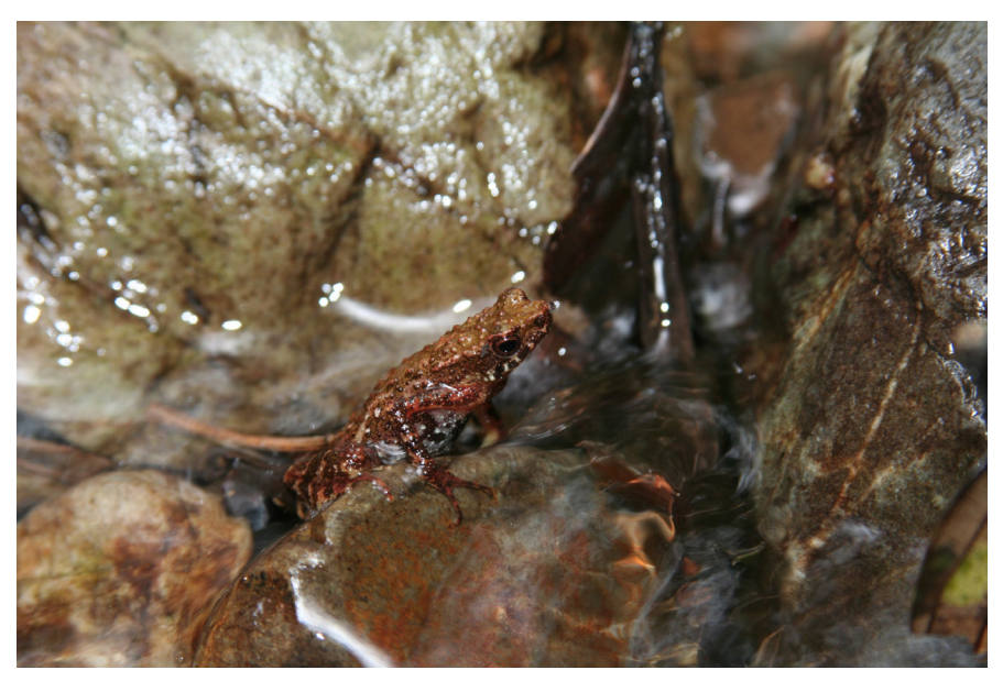
FIGURE 3. Ansonia hanitschi moving along the edge of Sungai Liwagu during the day in Gunung Kinabalu Park, Sabah, Malaysia.