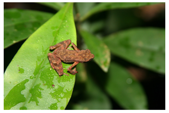
FIGURE 4 . Ansonia hanitschi resting on leaf at night near Sungai Liwagu, Gunung Kinabalu Park, Sabah, Malaysia.

= 58, P = 0.933) between toad locations (0.04 \pm 0.04 m-s, range 0–0.9 m-s) and random points (0.04 \pm 0.02 m-s, range 0–0.4 m-s). Quantities of woody debris (t =0.62, df = 54, P = 0.538) and leaf litter (t = 1.41, df = 54, P = 0.164) overlying rocky substrates did not differ significantly between used and available locations. Mean proportions of surface substrate composition differed between toad locations and random points (G= 19.00, df = 1, P < 0.001), with toads using areas with proportionately higher amounts of sand- and cobblesized substrates relative to their availability. During focal surveys, air temperature averaged 18.5 \pm 0.7^{\circ} C and relative humidity averaged 94 \pm 3\% . Mean cloud cover was 57 \pm 9%. Water temperature averaged 18.3 \pm 0.2° C, and water pH ranged from 6.85 to 7.31. Canopy closure along the stream averaged 79 \pm 5\% (40–93%). Mean stream gradient was 8 \pm 2\% (1–17%), and mean stream aspect was 22°.