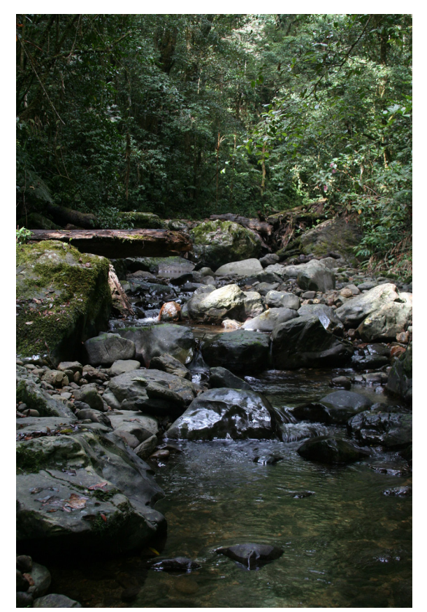
FIGURE 1. Section of reach surveyed for Ansonia hanitschi along Sungai Liwagu, Gunung Kinabalu Park, Sabah, Malaysia.

Zone 50Q 664160N; 449128E; elevation 1,512 m above sea level at the center of study area) on Gunung Kinabalu (Mount Kinabalu) in Gunung Kinabalu Park, Sabah, Malaysia. Sungai Liwagu is a perennial stream, with flatter reaches bearing broad banks of smaller substrates (sand, pebble, gravel, and cobble) and punctuated by shorter, higher gradient sections with larger boulder and bedrock substrates. The stream flows through mature tropical rainforest.