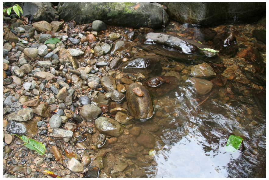
FIGURE 2. Typical diurnal microhabitat of Ansonia hanitschi along edge of Sungai Liwagu, Gunung Kinabalu Park, Sabah, Malaysia.

in which we observed toads, we set 10 equally spaced transects with a meter tape across the stream along the 150-m reach. Transects extended across the width of the stream channel. We averaged values for each variable measured across transects. We measured stream channel width (15 \pm 1 \text{ m}, \text{ range } 11 - 18 \text{ m}) and wetted width (6 \pm 1 \text{ m}) m, range 2-13 m) and recorded the substrate type at 1-m intervals along each transect within the wetted width, and determined which type was dominant across each transect. Cobble-sized substrates were dominant on 60% of transects and boulder-sized substrates on 40% of transects. We quantified canopy closure by taking a digital image of the canopy, as described above, from the center of the stream along each transect. We analyzed images in Adobe Photoshop Pro (Adobe Systems, Inc., San Jose, California, USA) following the methods of Silva-Rodrìguez et al. (2010) to determine percentage of canopy closure from each image. We measured canopy closure at 10 points along the stream. Stream gradient was measured at the center of each transect to a point 15 m downstream using a clinometer. We determined stream aspect facing downstream in transects 1, 5, and 10.