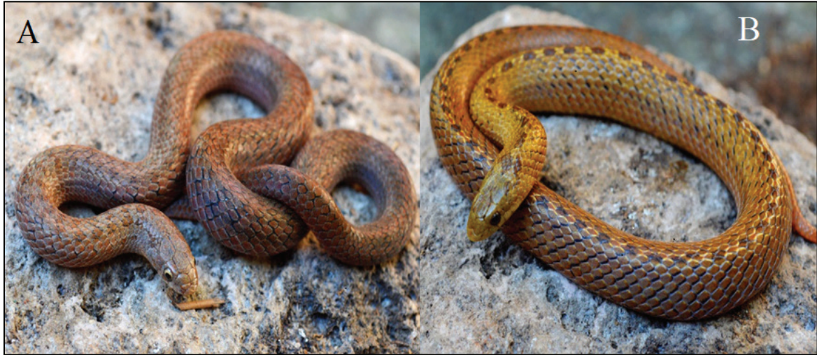
FIGURE 1. (A) An adult Two-lined Mexican Earthsnake ( Conopsis biserialis ) and (B) an adult Large-nosed Earthsnake ( Conopsis nasus ) on rock-retreat microhabitat from Michoacán, México. (Photographed by Ernesto Raya-García).

of optimal retreat sites in isolation (Downes and Shine 1998; Downes 1999).