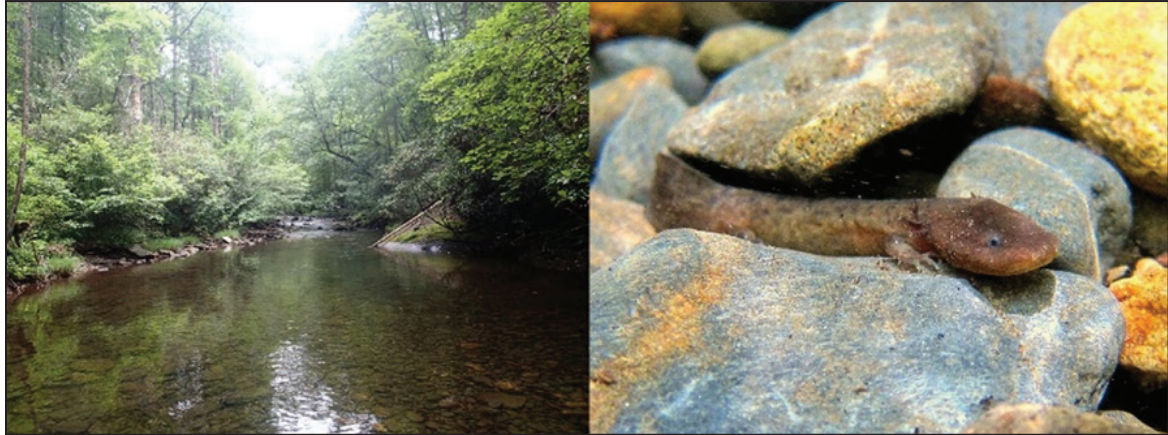
FIGURE 2. Typical 50-m stream reach for cobble surveys (left) and a representative gilled Eastern Hellbender ( Cryptobranchus a. alleghaniensis ) larva (right) from Upper French Broad River sub-basin, North Carolina, USA.

contain relatively stable hellbender populations with some evidence of recruitment (Mayasich et al. 2003). Many of these sites selected for this study have evidence of presence of adult hellbenders based on previous snorkel and rock-flipping (peavey) surveys (Rossell et al. 2013; Spear et al. 2015), underwater video-camera surveys (Unger et al. 2020c) that documented breeding activity (Unger et al. 2020a), encounters by anglers (Williams et al. 2019), and diurnal activity of adults (Humphries 2007). Despite some knowledge of adult presence, demographic information on recruitment is lacking; no formal surveys that target larval habitat have been conducted previously in these stream reaches. The Upper French Broad River sub-basin (North Carolina and Tennessee) and Hiwassee River sub-basin (Georgia, North Carolina, and Tennessee) encompass an area of 4,868 km 2 and 5,326 km 2 , respectively (Powell 2006). All sites were within the Blue Ridge physiographic province with similar underlying geography and to account for consistency for several covariates, including conductivity (Griffith et al. 2014).