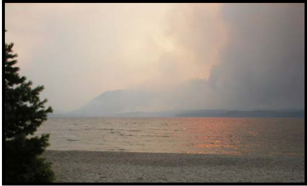
FIGURE 2. The Robert Fire burns on Howe Ridge, across Lake McDonald in Glacier National Park, Montana, USA on 10 August 2003.

fire. The vegetation data were summarized using Principal Components Analysis with varimax rotation on the correlation matrix to reduce the seven measures into orthogonal axes.