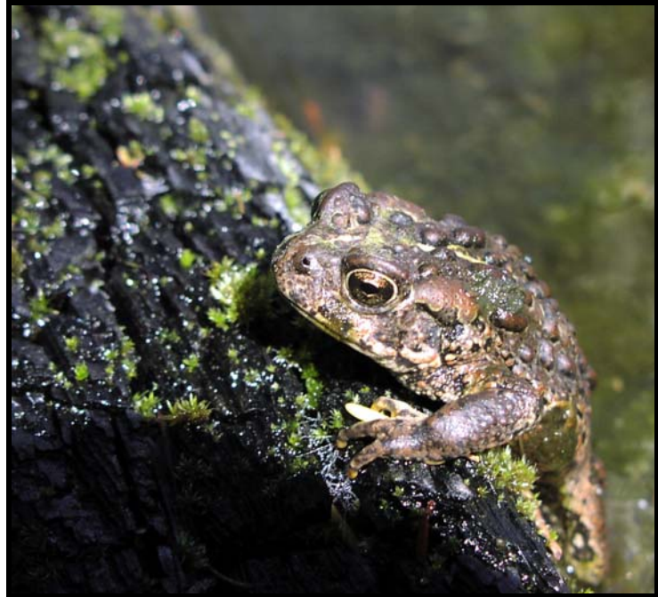
FIGURE 1. Boreal Toad ( Bufo boreas boreas ) in Glacier National Park, Montana, USA.

Burn severity classifications are based on the fire's effect on vegetation and soils, determined by combining indices derived from satellite imagery and field plots (Key and Benson 2005). Although the Robert Fire is