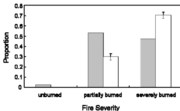
FIGURE 5. Expected (grey bars) and observed use (hollow bars; \pm 95% CI) of different burn severities by radio telemetered Bufo boreas in Glacier National Park, Montana, USA. The confidence intervals were calculated after excluding the unburned category, for which there were zero observations.

Toads used severely burned habitats more than expected and partially burned habitats less than expected. We recorded more than twice as many observations of toads in severely than in partially burned habitats, even though partially burned habitats were more common (Fig. 5). We never relocated toads in an unburned habitat. However, unburned habitats were rare in the study area, and we would have expected only 2.5% of observations in unburned habitats by chance. The exact 95% CI (Casella 1986) for 0 relocations (0–3.2%) includes the expected percentage of observations, so we cannot conclude that toads avoided unburned habitats. Selection for severely burned habitats decreased during the summer (ordinal date: b_1 = -0.054 [se = 0.021]; \chi^2 = 5.93 , df = 1 , P = 0.015 ), but the shift in use was not related to the change in microhabitat use ( \chi^2 = 1.73 , df = 2 , P = 0.421 ), nor an interaction between microhabitat use and ordinal date ( \chi^2 = 1.67 , df = 2 , P = 0.435 ). Use of burn severities differed by study site,