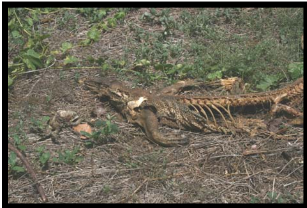
FIGURE 1. A radio-tracked Yellow-spotted Goanna ( Varanus panoptes ) that we found dead in August 2006 with a dead Cane Toad ( Bufo marinus ) found approximately 20 cm from its head.

We used more powerful transmitters and a different methodology for attachment to goannas in subsequent years. In September 2003, we attached the transmitters (Holohil model # AI-2B; 43 x 15 mm, mass 30 g, battery life expectancy 36 months) to the tails of another 10 male goannas. The SVL of these males ranged from 50 to 66 cm and mass ranged from 2,287 to 6,010 g. In September 2005, we radio-tagged another five males (SVL 58–66 cm, mass 2,875–5,050 g). We anaesthetised the goannas using halothane and drilled two holes, 45 mm apart, through the dorsal part of the tail about 30 cm from the vent. Two plastic cable ties inserted through the holes of the tail and brass casing of the transmitter held transmitters sufficiently tight so that the transmitters remained aligned along the tail. As the dorsal part of the tail consists mainly of cartilage, and very thick keratinous skin, this method resulted in