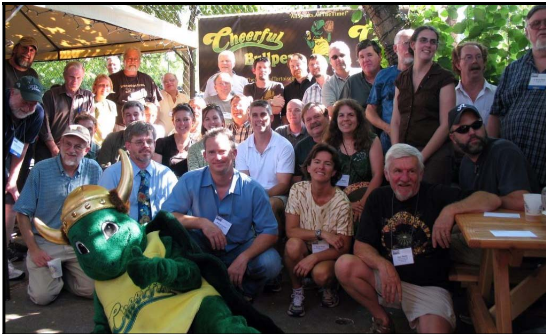
FIGURE 1. Attendees at the first meeting and social for Herpetological Conservation and Biology . See Table 1 for names of those photographed.

2. Each attendee then introduced themselves and their role in Herpetological Conservation and Biology (e.g.,