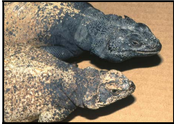
FIGURE 1. Male (upper) and female Common Chuckwallas ( Sauromalus ater ) from the Phoenix Mountains, Phoenix, Arizona (Photographed by Brian K. Sullivan).

Study populations. —Although Common Chuckwallas are large and long-lived, they are typically wary and thus, difficult to census (Sullivan and Flowers 1998;