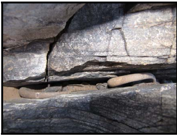
FIGURE 6. Common Chuckwallas in a crevice at the Piestewa Peak site. Note extensive layering of parent rock material (metamorphosed sedimentary rock) predisposed to formation of crevices.

and favored plant density were not correlated ( r_s = 0.58 , P = 0.14 , N = 8 ), obviating concerns of multi-collinearity in the MLR.