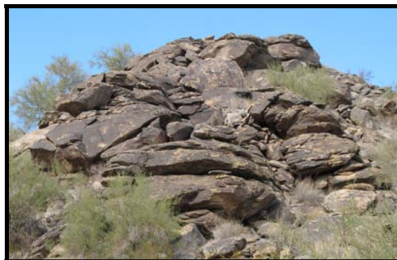
FIGURE 3. Trails at both the Shadow Mountain (top) and the Lookout Mountain (bottom) sites run along ridge tops resulting in degradation of crevices and loss of favored food plants for Common Chuckwallas.