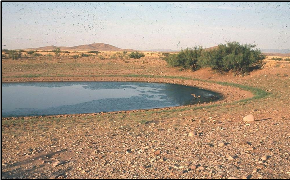
FIGURE 1. Stock tank in Cochise County, Arizona where turtles were initially collected from 2000-2002. The green ring indicates a higher previous water level.