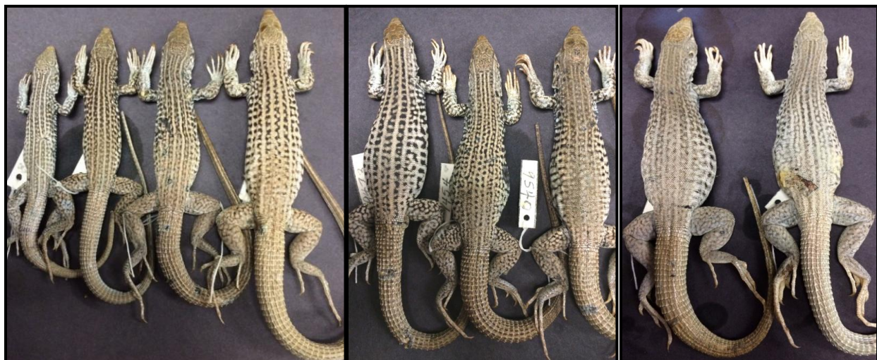
FIGURE 2. Variation in dorsal color patterns of Aspidoscelis tigris septentrionalis (Plateau Tiger Whiptail): Frame 1 (left), UADZ 9548 (♀ 57 mm SVL), UADZ 9547 (♀ 64 mm SVL), UADZ 9545 (♀ 74 mm SVL), UADZ 9546 (♀ 83 mm SVL) ontogenetic series from San Juan County, Utah; Frame 2 (middle), UADZ 9473 (♀ 85 mm SVL), UADZ 9454 (♀ 87 mm SVL), UADZ 9540 (♀ 87 mm SVL) individual variation from Mohave County, Arizona; Frame 3 (right), UADZ 9494 (♀ 80 mm SVL) and UADZ 9483 (♀ 77 mm SVL) individual variation from San Juan County, New Mexico.

contrast between stripes and fields from head to base of tail). Only Sample 1 among the 17 samples included a single color pattern class that being P. All other samples from west of the Colorado River in Arizona, including Sample 11, comprised color pattern classes T and D, though their proportional representations were not given by the authors. We could not consistently apply the P, T, and D pattern designations of Taylor and Buschman (1993) because it was not possible to determine the extent to which they were based on individual, ecotypic,