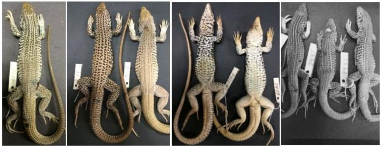
FIGURE 1. Variation in dorsal and ventral color patterns of Aspidoscelis tigris septentrionalis (Plateau Tiger Whiptail): Frame 1 (left), UADZ 9245 (♂ 84 mm SVL) from Kane County, Utah; Frames 2 and 3 (middle two), L, UADZ 9466 (♂ 100 mm SVL) from Mohave County, Arizona, and R, UADZ 9479 (♂ 100 mm SVL) from San Juan County, New Mexico; Frame 4 (right), L, UADZ 9460 (♀ 59 mm SVL) from Mohave County and M, UADZ 9487 (♂ 56 mm SVL) and R, UADZ 9488 (♀ 58 mm SVL) from San Juan County.

congruence between strongly contrasted and faded dorsal patterns, respectively, and variation in six meristic characters (Table 2).