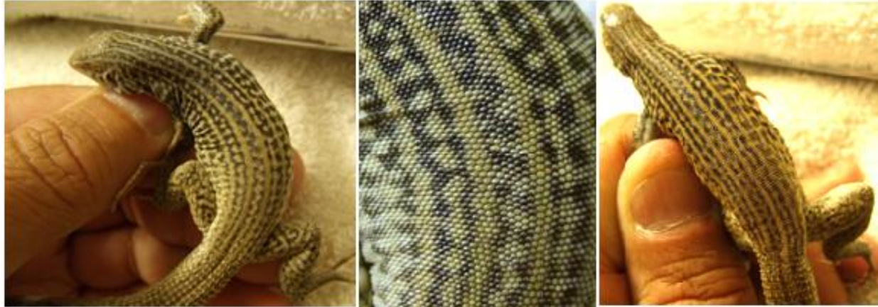
FIGURE 4. Individual variation in dorsal color pattern of two live adults of Aspidoscelis tigris septentrionalis (Plateau Tiger Whiptail). Frame 1 (left), UADZ 9241; Frame 2 (middle), close up of UADZ 9241; and Frame 3 (right), UADZ 9242 both from Aztec, San Juan County, New Mexico.

on each side between the dorsolateral and paravertebral (position three). Side-by-side comparisons of adults revealed striking individual differences in the details of dorsal patterns (Fig. 2, Frame 2). Nevertheless, 18 (75%) were characterized by strongly contrasting patterns over the entire dorsum, whereas only six (25%) had faded patterns on the posterior aspect of the dorsum.