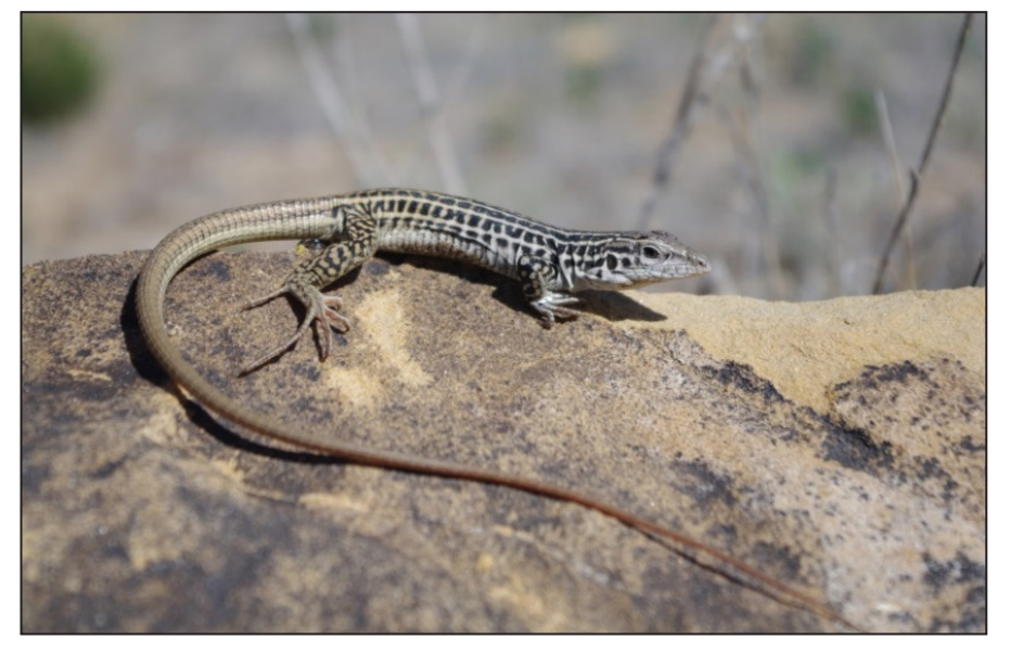
FIGURE 2. Right side of an individual of Common Checkered Whiptail, Aspidoscelis tesselatus (released), from May 2013 from along western rim of Carrizo Canyon, Comanche National Grassland, Baca County, Colorado, USA. The individual shows a distinct pale-colored lateral and dorsolateral stripes though showing some interruptions (= breaks) on the neck, pale-colored vertical bars extending from the lateral stripe into the lower and upper lateral fields, and bars forming in posterior aspect of dorsolateral field. All are characters of A. tesselatus C rather than of A. neotesselatus B.