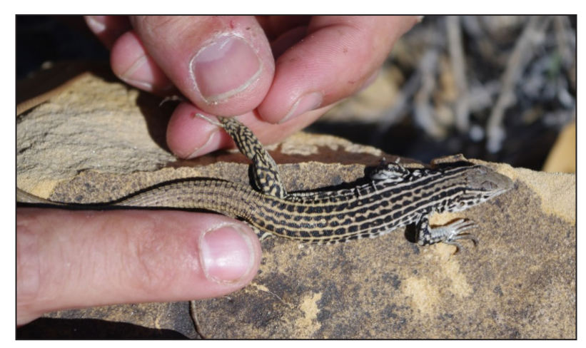
FIGURE 3. Dorsum of an individual of Common Checkered Whiptail, Aspidoscelis tesselatus (released), from May 2013 from along western rim of Carrizo Canyon, Comanche National Grassland, Baca County, Colorado, USA. The individual shows a distinct palecolored dorsolateral and paravertebral stripes, zig-zag vertebral stripe with extensions to paravertebral stripes, vague indications of pale stripes and dark fields on the tail, and bars forming in the dorsolateral fields. All are characters of A. tesselatus C rather than A. neotesselatus B.

from preserved specimens for comparisons among samples. We euthanized lizards with an overdose of 20% benzocaine (Orajeltm, Church & Dwight Co., Inc., Ewing, New Jersey, USA) and preserved them in 10% formalin for inclusion in the UADZ collection.