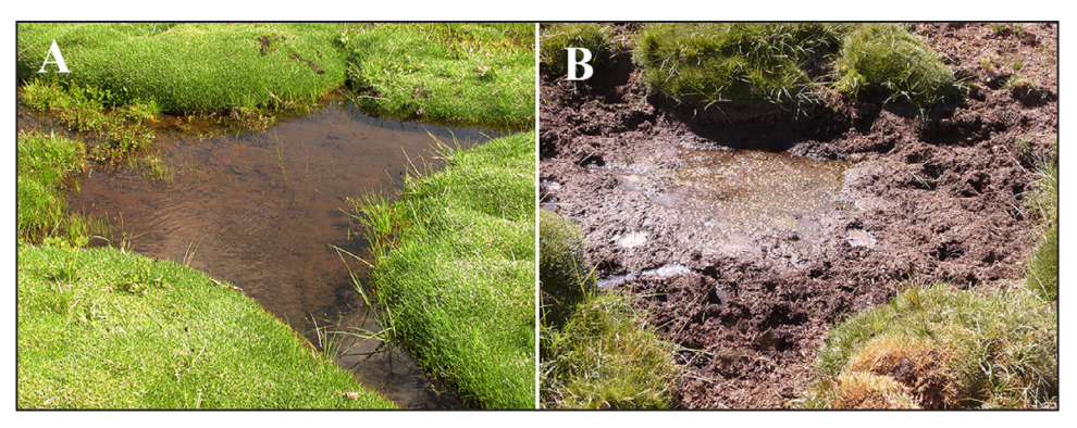
FIGURE 4. Livestock as potential threat for the Pehuenche Spiny-chest Frog ( Alsodes pehuenche ). (A) Breeding pond at Paso Pehuenche, Argentina, in 2008. (B) The same pond after recent impact by livestock. Since 2016 no frogs have been found at this place. (Photographed by Valeria Corbalán).

did not measure habitat variables, the new sites we found were very similar to previously documented habitats. That is, new occurrences do not necessarily mean that there is a wider range of environmental conditions that the species can withstand.