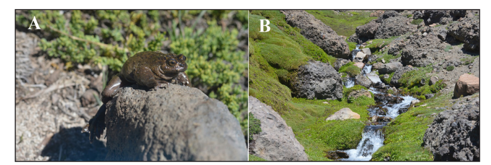
FIGURE 3. (A) Adult male Pehuenche Spiny-chest Frog ( Alsodes pehuenche ) sampled for Bd at Veranada del Callao ( Bd -positive). (B) Habitat of A. pehuenche at Veranada del Callao.

The information provided in this study is valuable for conservation because the new populations increase the EOO fivefold, from 95 km<sup>2</sup> (IUCN 2019) to 497.9 km<sup>2</sup>. Despite this substantial increase, the extent of wetlands within the EOO is limited, meaning that the available habitat for the species remains small. We estimated AOO at only 4.84 km<sup>2</sup>. This is similar to the initial estimate (5 km<sup>2</sup>; IUCN 2013) and smaller than the most recent: 32 km<sup>2</sup> (IUCN 2019). We feel our estimate is more accurate because we used precise imagery with 10 × 10 m cells, whereas the previous estimate was based on lower-resolution images with 4 × 4 km cells. Larger cell size may be appropriate for some taxa but could overestimate areas for taxa that live in specific microhabitats, such as these frogs. Although we