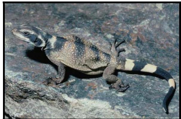
FIGURE 1. A juvenile Common Chuckwalla ( Sauromalus ater ).

Habitat fragmentation and destruction due to urbanization is occurring throughout the United States,