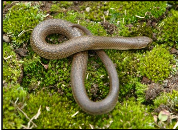
FIGURE 1. Earthsnake ( Conopsis biserialis ) from Ocoyoacac, México.

fragmentation of the forest. We describe some aspects of the ecology of C. biserialis from the State of Mexico. Specifically, we describe the temporal abundance, body size, reproductive condition, body temperature, and diet. We compare our data with other fossorial-snake species.