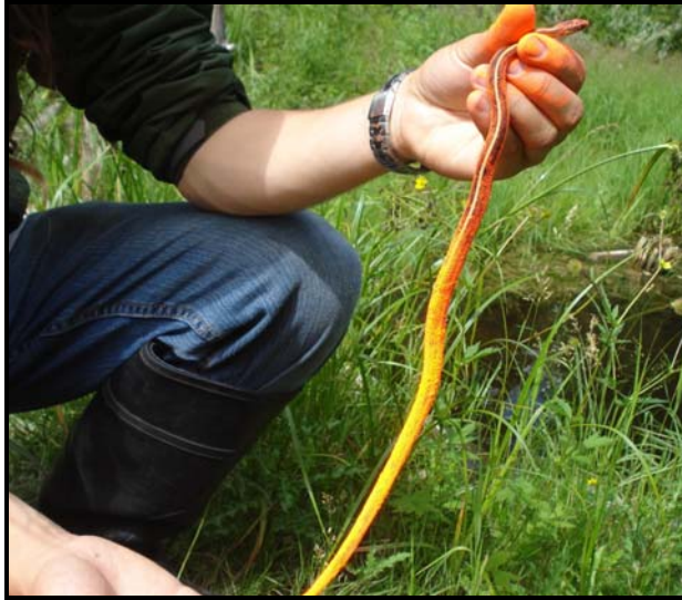
FIGURE 1. Common Garter Snake ( Thamnophis sirtalis ) immediately following application of orange fluorescent powder.

gently tipping the bag in various directions to coat all sides of the snake (Fig. 1). Powdering was carried out away from the capture/release area. During powdering, the snake's head was kept out of the bag to ensure that no powder got into the eyes or mouth. The powder we used (approx. $10 US/lb, Radiant Color Series T1, DayGlo Color Corporation, Cleveland, Ohio) was either orange or green. Graeter and Rothermel (2007) suggested that green was among the best performing color (the other being chartreuse) followed by orange and pink. Our selection of color was based upon proximity to other snakes released the same day and to previous tracks that persisted in the environment. Thus we avoided confusion of individual paths, as suggested by Stark and Fox (2000). Once the powder was applied, we carried snakes to the site of release, still within the bag, and then removed and placed them on the ground. We released all snakes within 5 m of their original capture sites when the temperature was > 15^{\circ}\text{C} ; time of release varied from late morning to early afternoon.