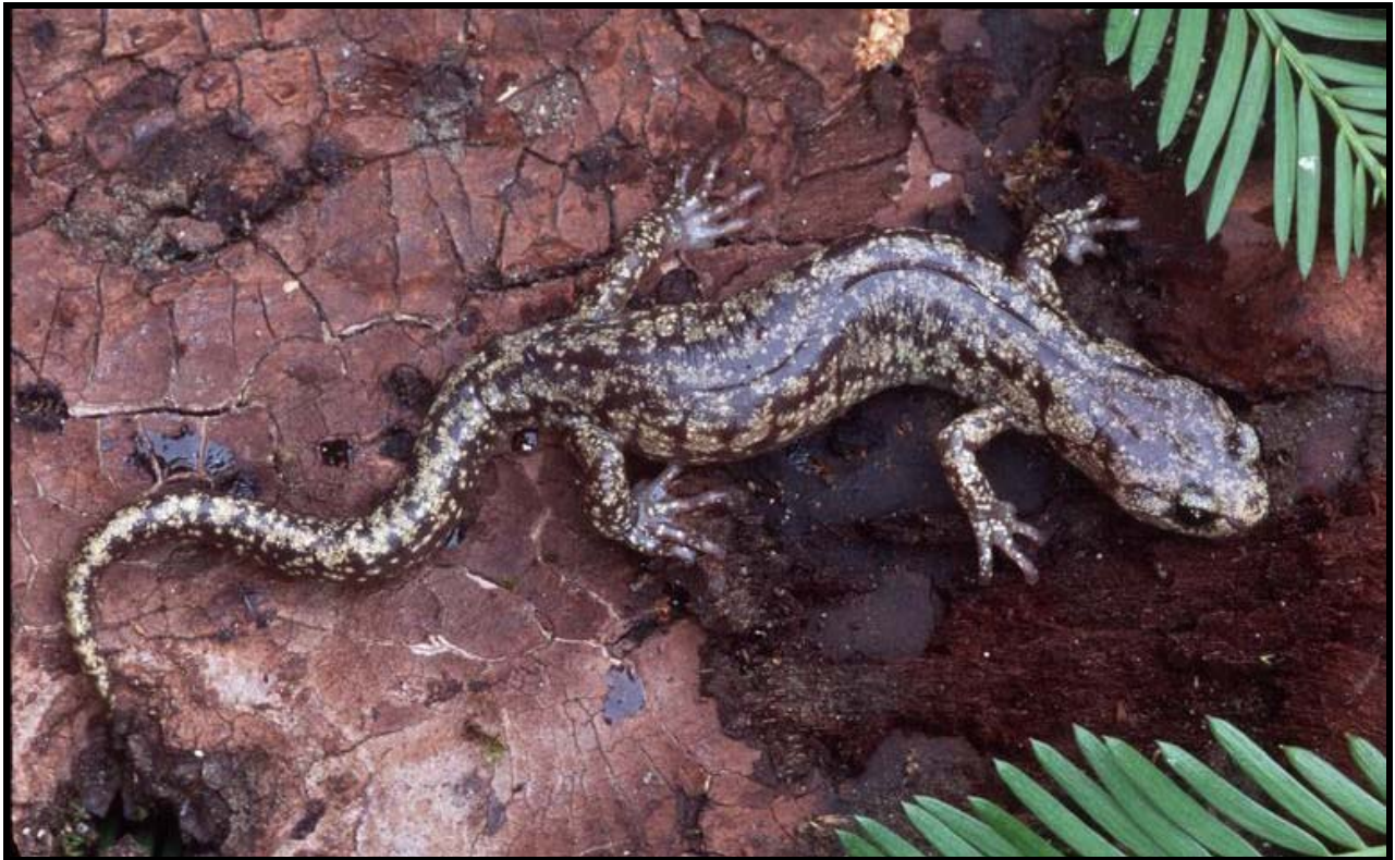
A Wandering Salamander ( Aneides vagrans ) from Humboldt County, California (United States).